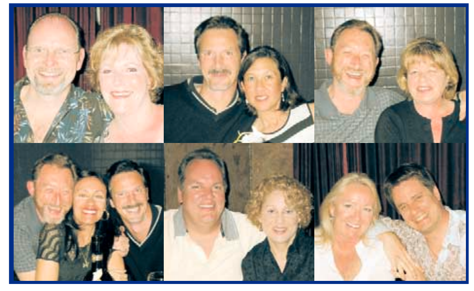
Meet the Board—Past, Present and Significant Others

June 4-6, 2004 is First River Trip of the Season! Sign Up Today!