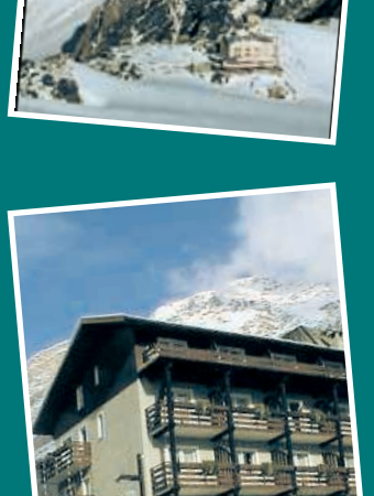
Hotel Baita del Pini ****